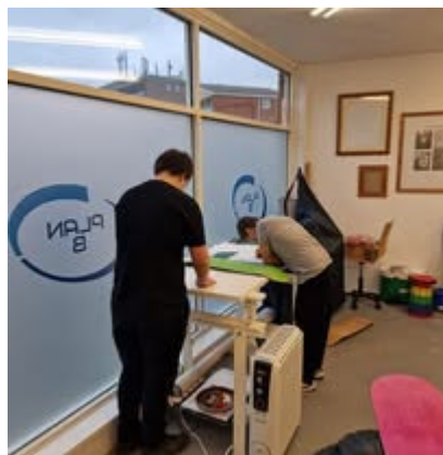
Barista & front of house